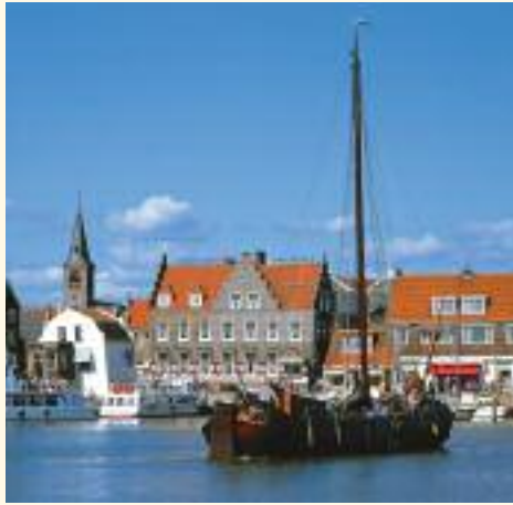
Step back in time in the charming port of Volendam, a traditional Dutch fishing village.

throughfare is lined with colourful cafés and purveyors of fresh fish, handmade cheeses and a myriad of traditional crafts.