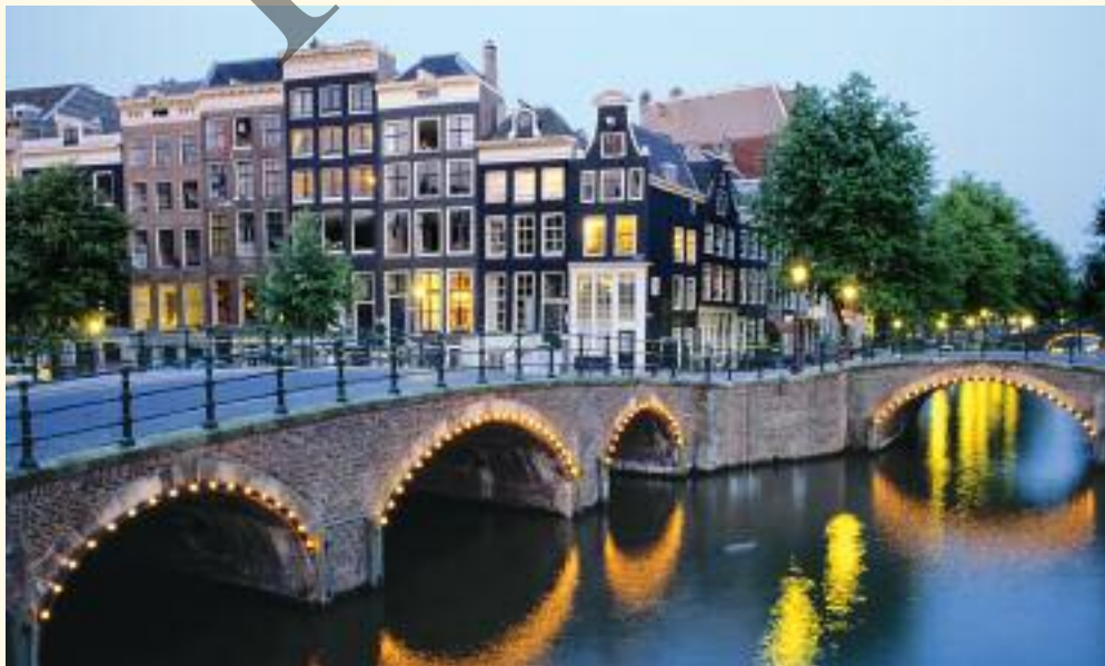
Amsterdam's charming bridges and picturesque canals bring the intimacy of a small town to one of Europe's most celebrated cities.

Eighteenth-century row houses, sleepy canals and a picturesque waterfront evoke the glory days of the Zuiderzee and typify the beauty and charm of the Dutch fishing port of Volendam, where many residents still don the traditional dress of the region. Built along the top of a dike, the village's primary