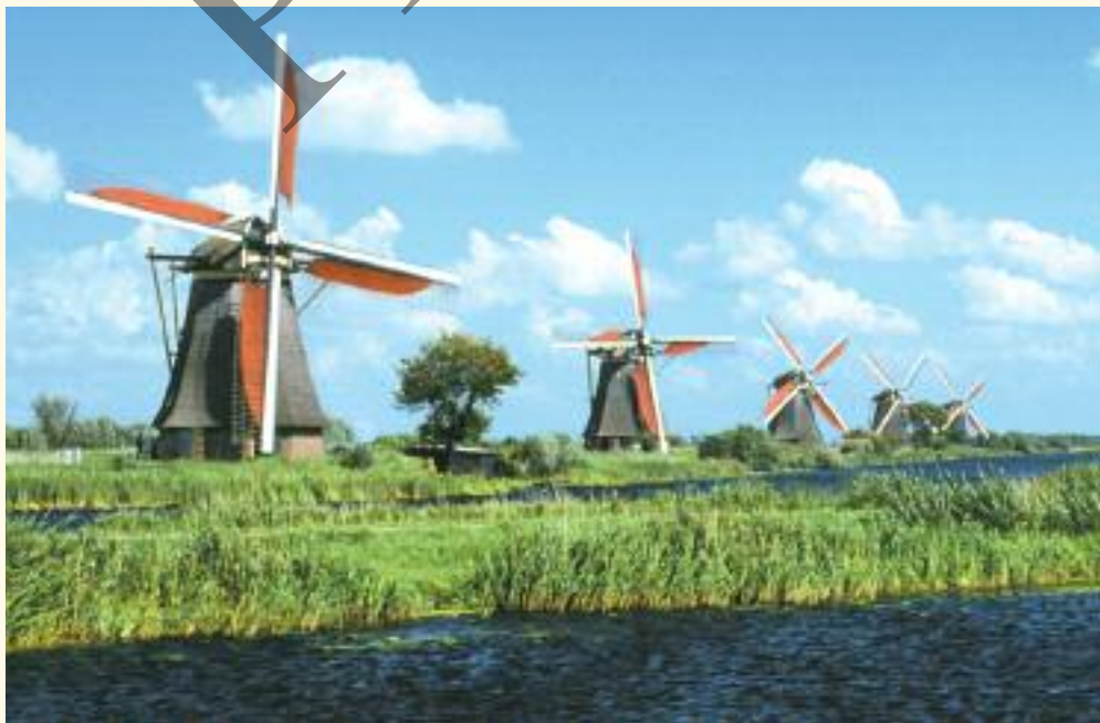
Tour authentic 18th-century windmills, the perfect examples of innovative Dutch engineering, at Kinderdijk. Inset above: Many residents of Volendam still wear the traditional costume of North Holland.