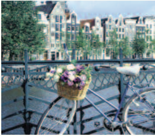
Historical Amsterdam is a city of canals and charming 16th- and 17th-century merchants' houses.

Neither Carleton University nor the Carleton University Alumni Association will be responsible for the financing, the arranging or the conducting of these tours. They assume no liability or responsibility for damages or financial loss to person or property of any description, that might occur in connection with these tours howsoever arising from the negligence, omission or otherwise of travel services arranged through Thomas P. Gohagan & Company.