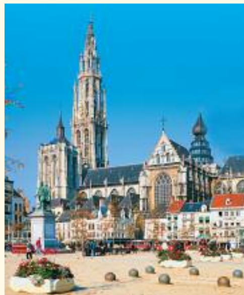
Antwerp's 16th-century Cathedral of Our Lady was inscribed on the UNESCO World Heritage list of Belfries of Belgium and France in 1999.

Since the 17th century, flowers have been a major Dutch industry. Visit the Aalsmeer Daily Flower Auction, the world's largest, where the international market prices for flowers and plants are determined each day. Almost 19 million flowers are sold to distributors each day in the world's third largest building (nearly 985,000 square metres).