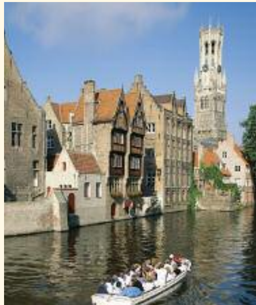
Cover: Cruise through Holland, where kilometres of tulip blooms announce the arrival of spring.