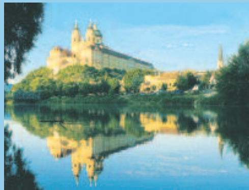
Founded in 1089, the Austrian Benedictine Melk Abbey housed a world-renowned monastic library.

Heritage site and the best-preserved mediaeval city in the Czech Republic. Built during the 13th century, the castle and surrounding village overlook the Vltava River. Enjoy lunch and a walking tour before continuing on to Prague. On arrival, check into the deluxe HOTEL INTERCONTINENTAL PRAHA, located near the historic Old Town.