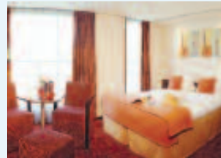
Stateroom Category 4

The M.S. AMADEUS BRILLIANT meets the highest safety standards and is part of the only fleet of European river ships to have been awarded the “Green Certificate” of environmental preservation.