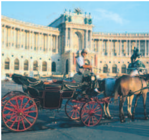
Until 1918, the Hofburg Palace, located in the heart of Vienna, was the centre of the Habsburg monarchy.

Cover photo: Budapest's majestic Parliament Building is a classic example of Gothic Revival architecture and a proud symbol of Hungary's national rebirth.