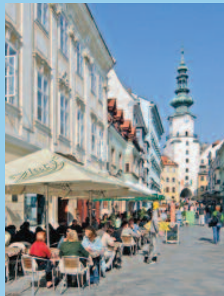
The 13th-century fortification, Michael’s Gate, towers over Bratislava’s lively Old Town.