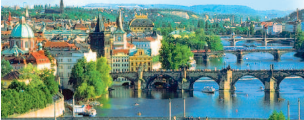
Photo this page: In Prague, the “City of Spires,” walk on the famous Charles Bridge, which links the mediaeval Old Town with the splendid Baroque palaces of the Little Quarter, the city’s most intact historical district.

The charming mediaeval village of Dürnstein sits below the hilltop ruins of Castle Kuenringer, where Richard the Lionheart was held prisoner after the Third Crusade. Walk through the tiny, picturesque village to the Assumption of the Blessed Virgin Abbey Church. Then, cruise the Danube’s spectacular and fabled