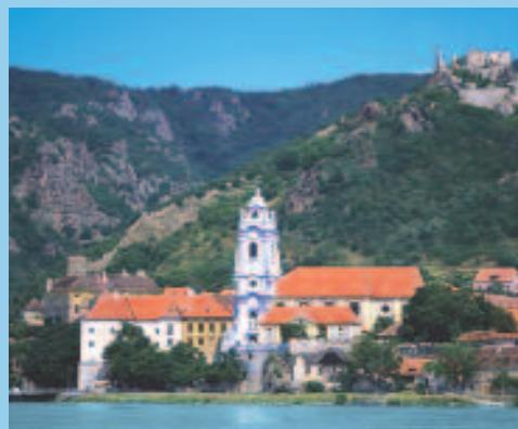
The charming hamlet of Dürnstein is nestled within the rolling Wachau Valley, a UNESCO World Heritage site.

where all of Poland's kings were crowned and buried. Walk into the Old Town and to Rynek Główny, or "Main Market Square." Visit the 14th-century twin-spired Mariacki (St. Mary's) Church, one of the finest Gothic structures in Poland, to see the famous mediaeval altar by Wit Stwosz. From the church's tower, a lone trumpeter sounds a haunting call every hour on the hour, in commemoration of a warning of an impending attack by the Tatars in mediaeval times. Pass by the former residence of Pope John Paul II, where he lived while Archbishop of Kraków.